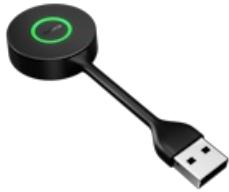
Jabra Link 400a USB-A, DECT, MS