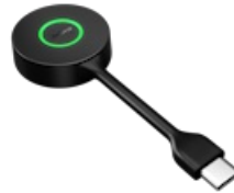
Jabra Link 400c USB-C, DECT, UC