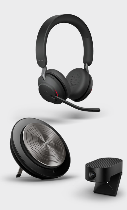
Find out more on jabra.com